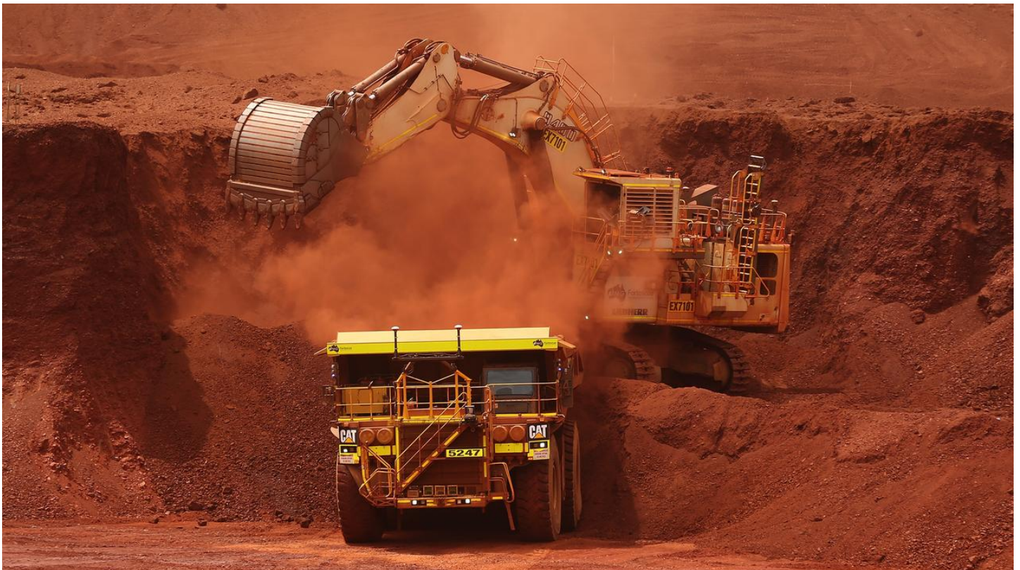
A drop in hydration levels could have dangerous implications for miners.

Even small changes in hydration levels can have oversized effects on people. Indeed just a few percentage points drop in hydration can have the same impact as being over the blood alcohol limit which becomes dangerous when heavy trucks and dangerous machinery is being operated in stifling conditions.