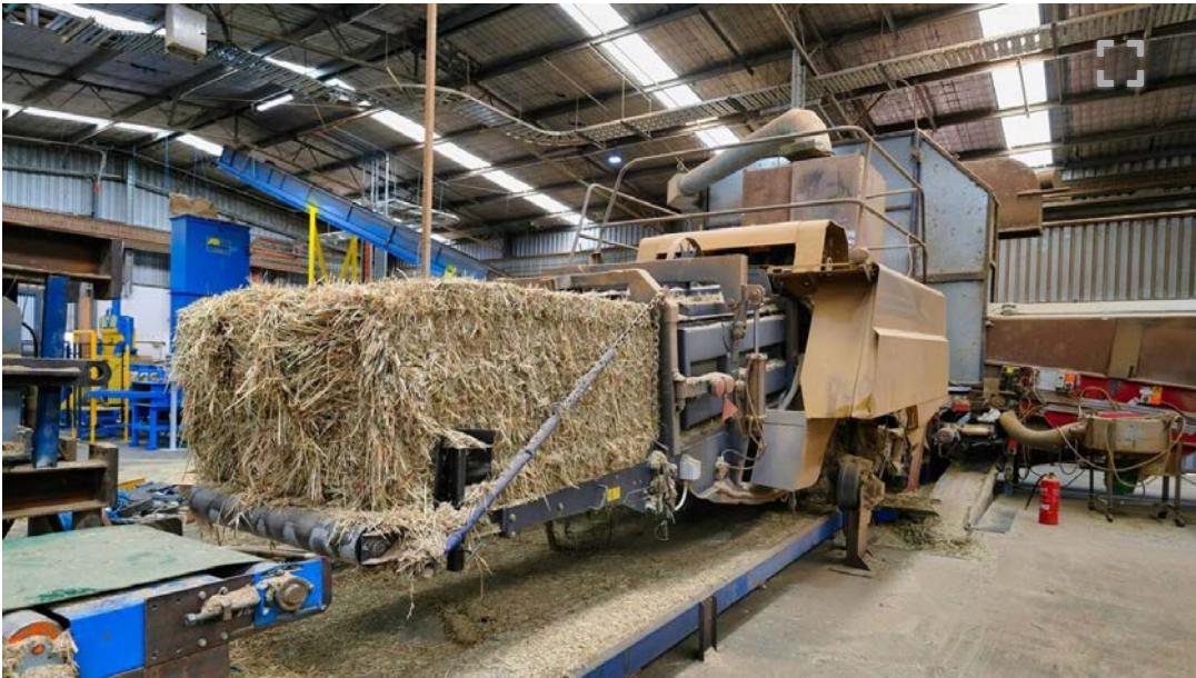
The Pyrenees Hay plant at Avoca.

The company is exporting to China, Korea, Japan and Taiwan.