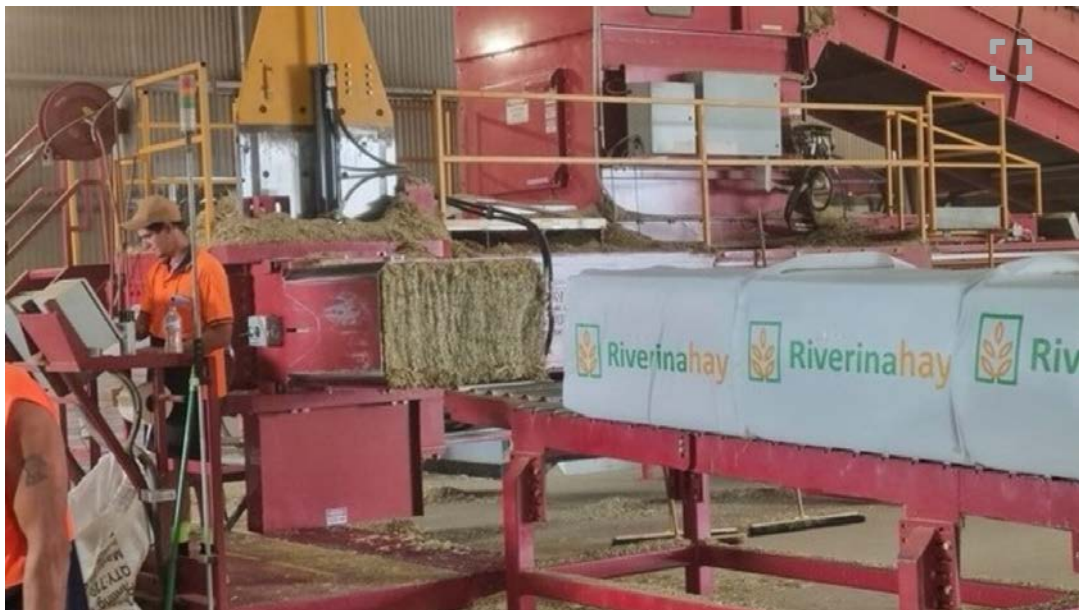
Processing hay at the export plant near Griffith.

New owners of a hay processing plant near Griffith are hoping Riverina farmers see the operation as an option for buying oaten hay.