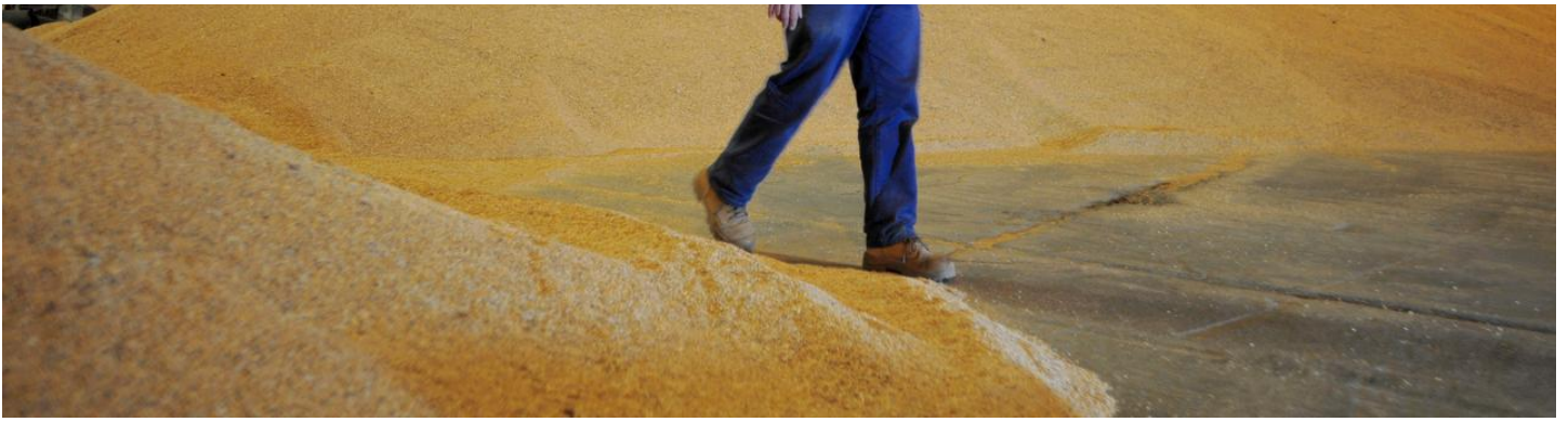
Even wheat can be traced back to its specific paddock.

“Because of our governance frameworks, our regulatory frameworks, it actually comes out of Australia in pretty good shape from an ethical and social perspective, and an environmental one, frankly, because of the regulations that are around it”.