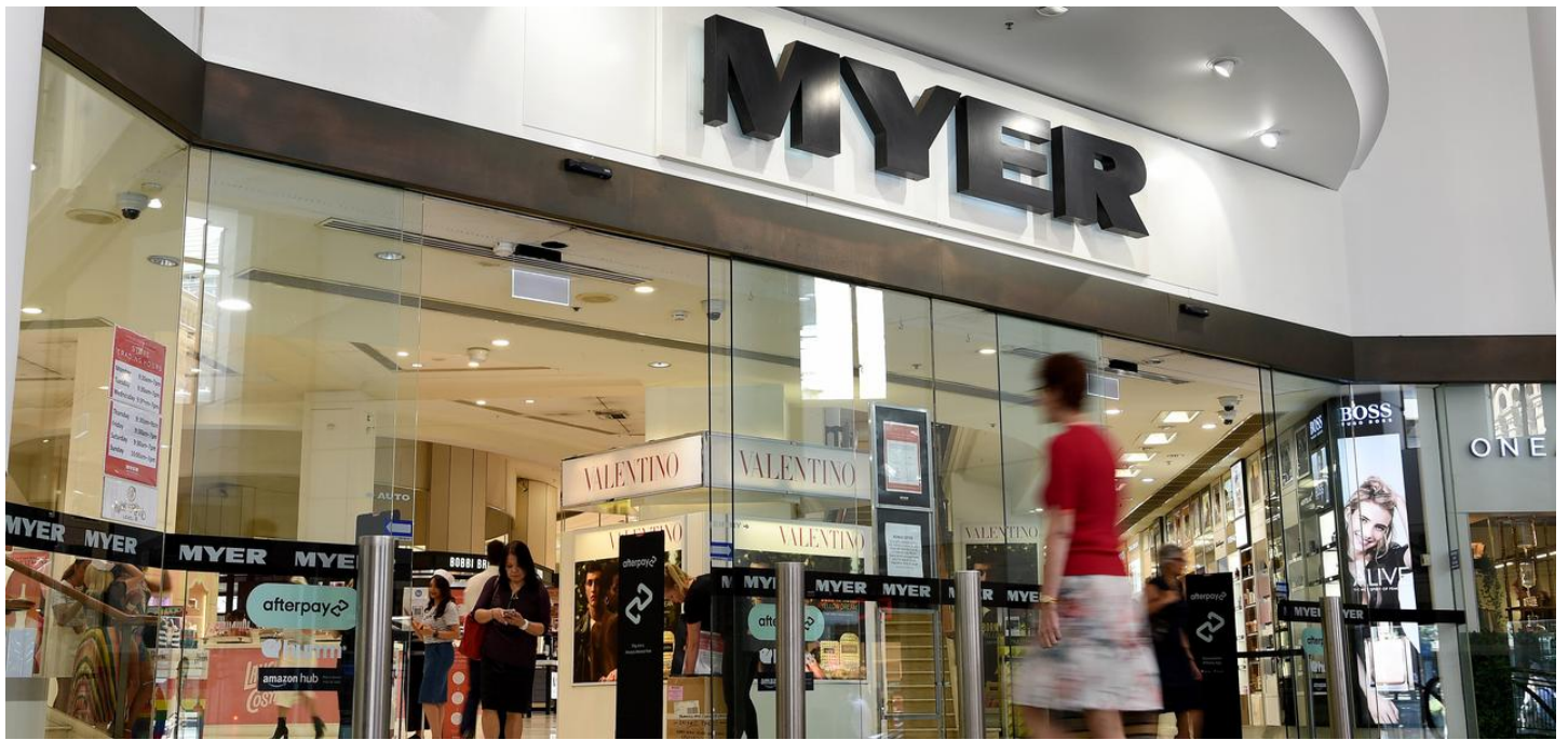
The Myer store in Pitt St Mall, Sydney.

“We saw during the first sort of early stages of the pandemic, big swing out CBDs because no one was in them to regional and suburban stores.