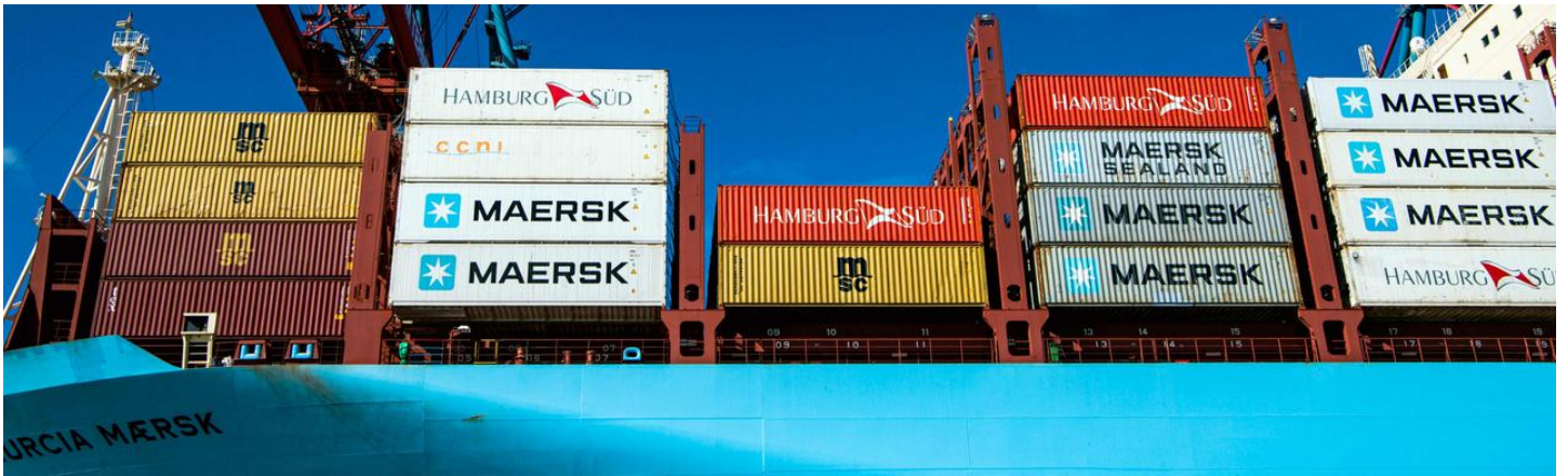
Trade bans and sanctions are becoming more widely used.

In agriculture this could relate to different prawn farms or wheat growing regions. And like Google Maps drilling down into finer detail, each farm carries its own fingerprint or it can be broken down to even smaller detail.