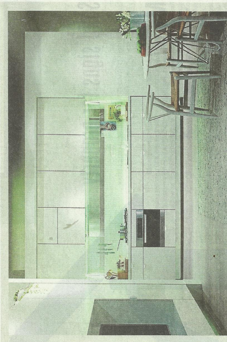
Clean-cut: the building (left) will feature apartments that capture a Scandinavian aesthetic (above).

says is designed to "evoke warmth, tranquility and a sense of belonging while allowing residents to add their own finishing touches". The design has plenty of built-in cabinets and includes Caesarstone benchtops, soft-closing drawers and tiled and mirrored splashbacks in the kitchens. Bathrooms are fully tiled and include stone vanity units.